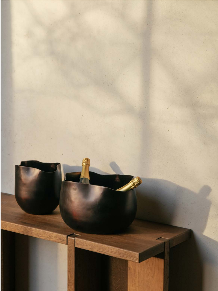
GRAVITY - CHAMPAGNE COOLERS