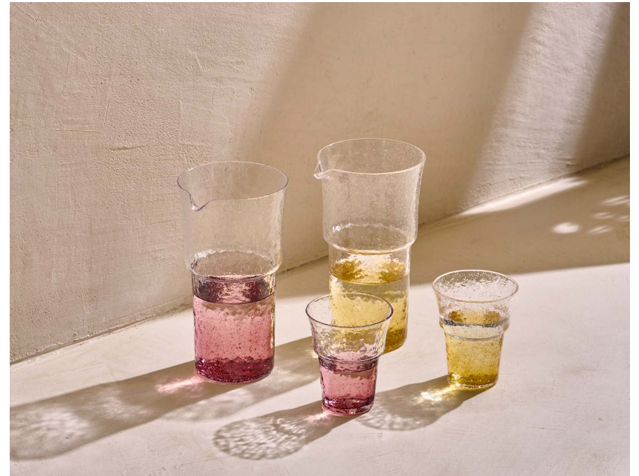
INKRA - GLASSWARE