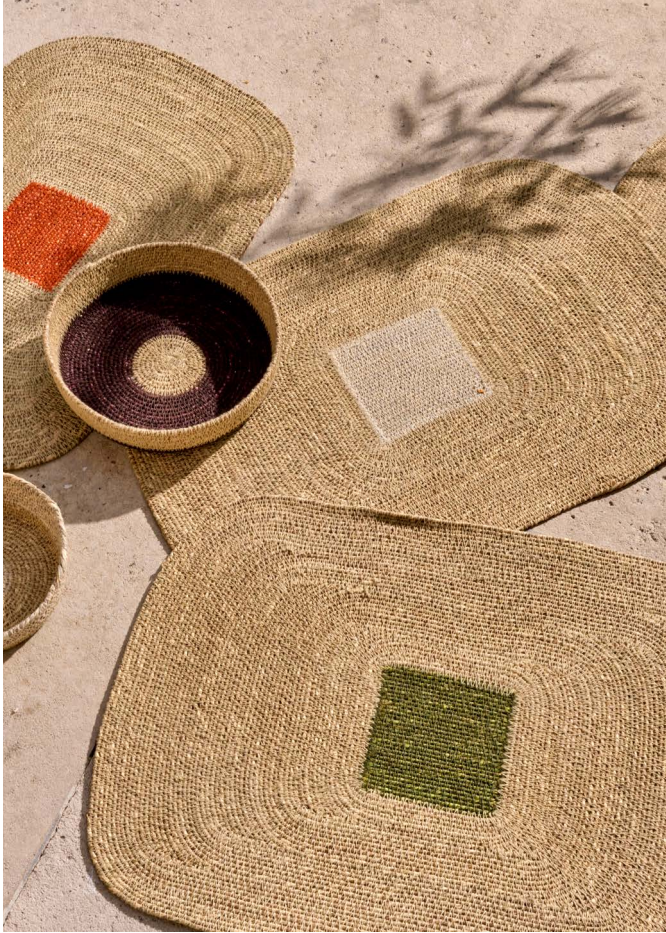
QUADRI - TABLE LINEN