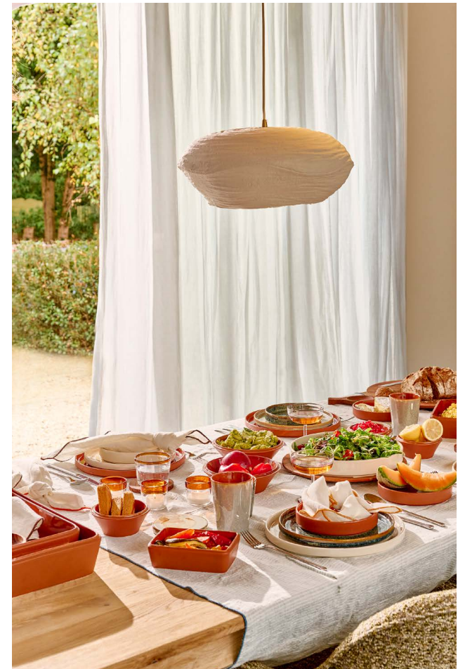
RASA - PORCELAIN TABLEWARE TARIFA - GLASSWARE