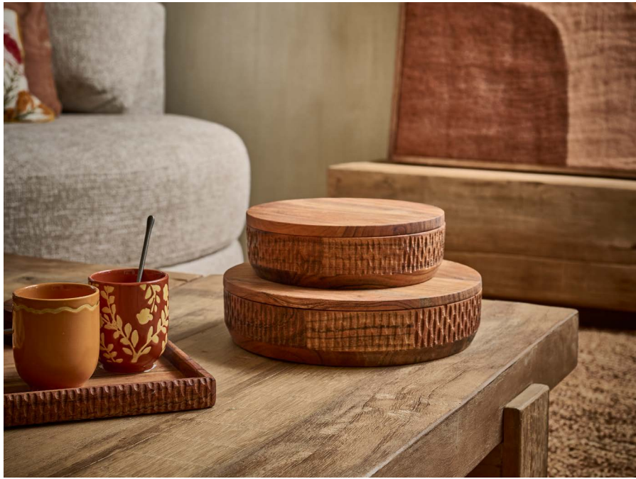
HOMMAGE - TABLEWARE ACCESSORIES