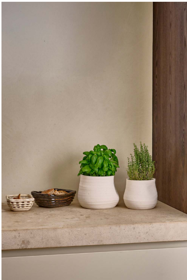
PANEA - BREAD BASKETS PUNCH - TABLEWARE ACCESSORIES