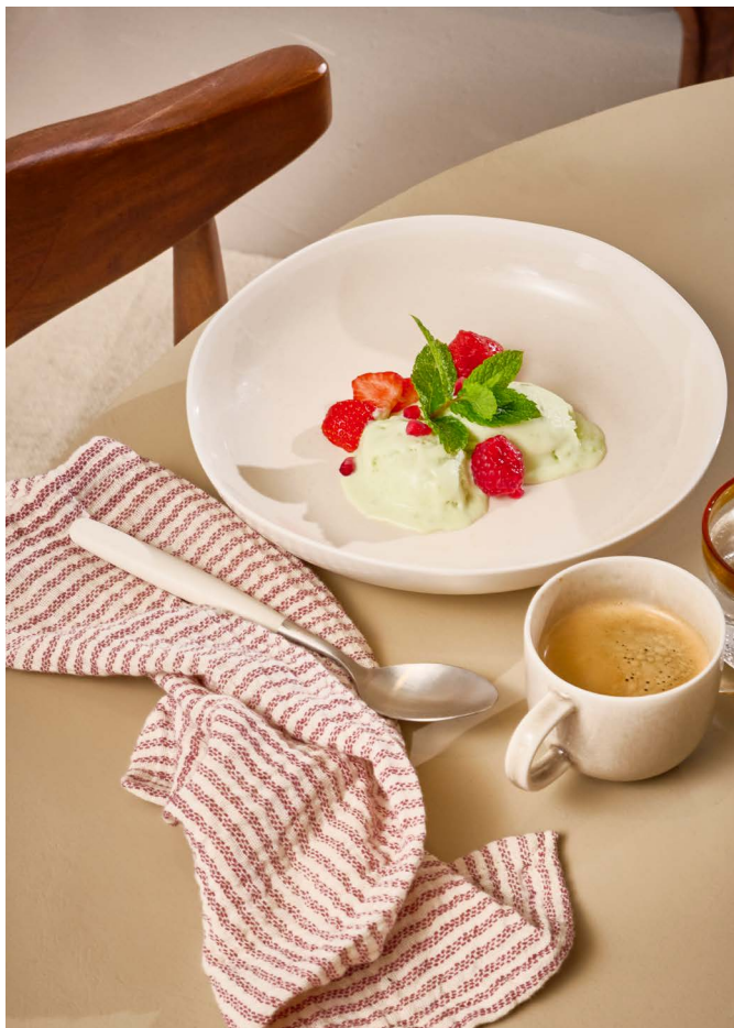
BISCOTTI - PORCELAIN TABLEWARE