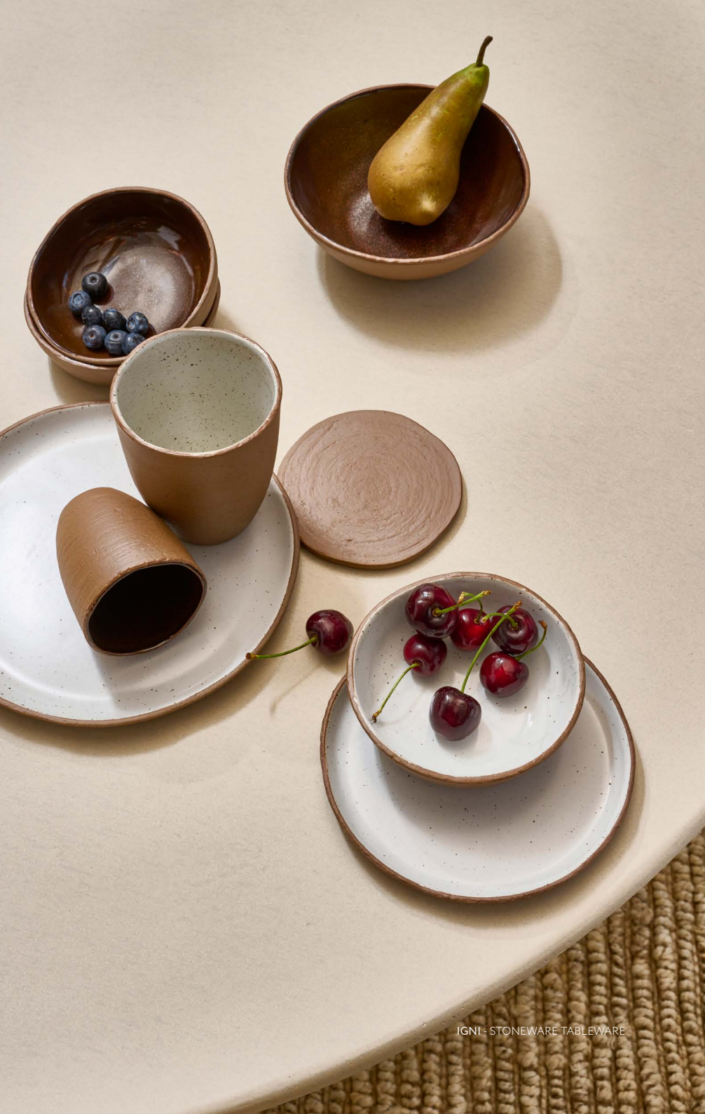
IGNI - STONEWARE TABLEWARE