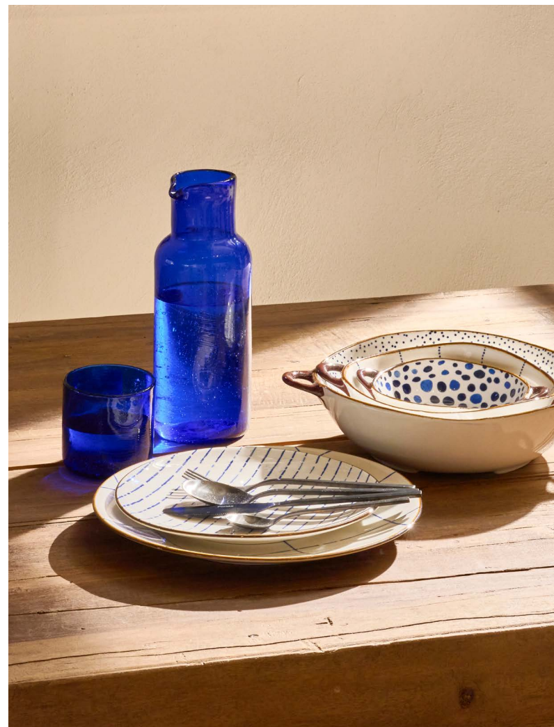
ANAFI - PORCELAIN TABLEWARE VICO - GLASSWARE