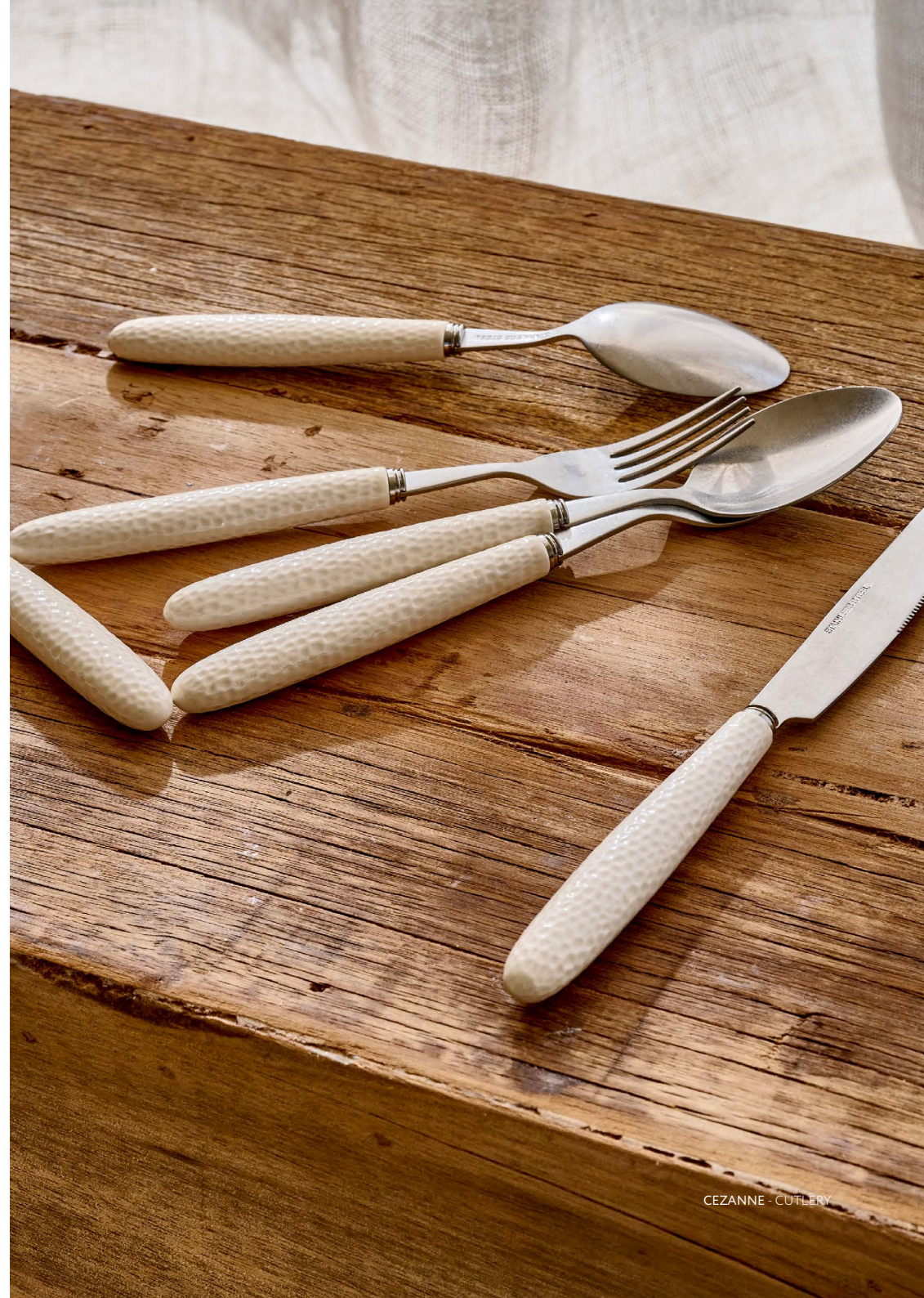
CEZANNE - CUTLERY