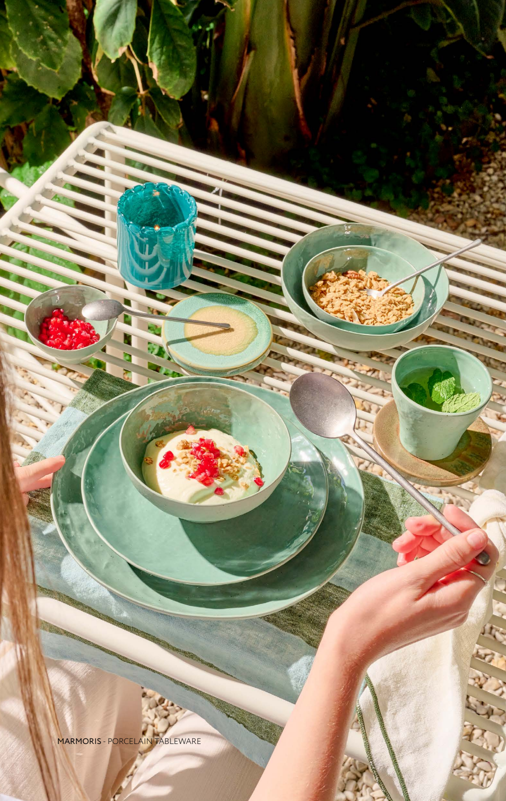
MARMORIS - PORCELAIN TABLEWARE