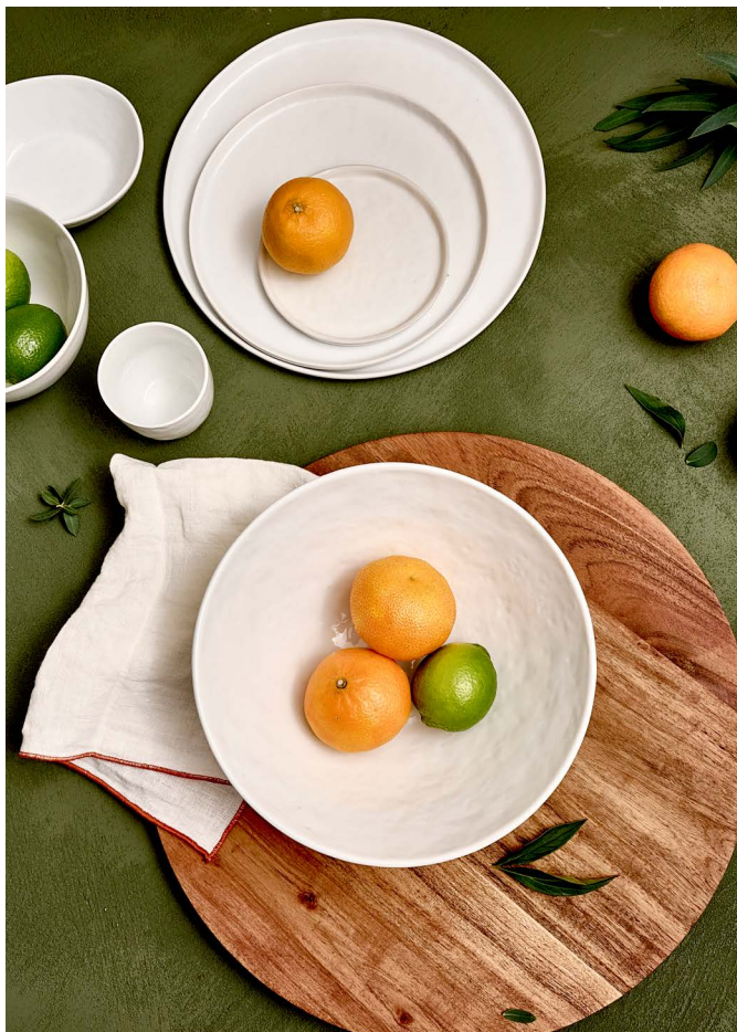
PORCELINO - PORCELAIN TABLEWARE