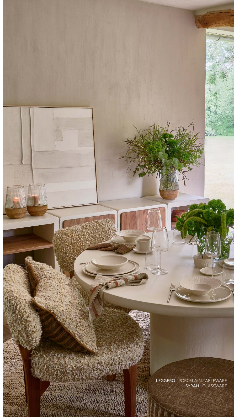
LEGGERO - PORCELAIN TABLEWARE SYRAH - GLASSWARE