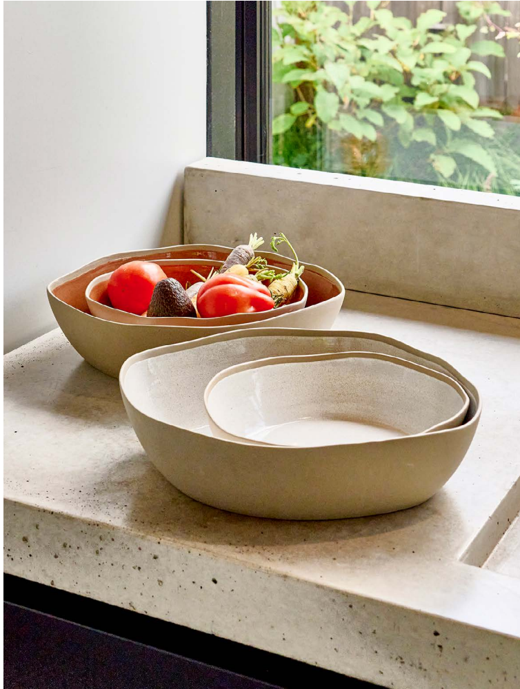
PRIMEVAL - PORCELAIN TABLEWARE