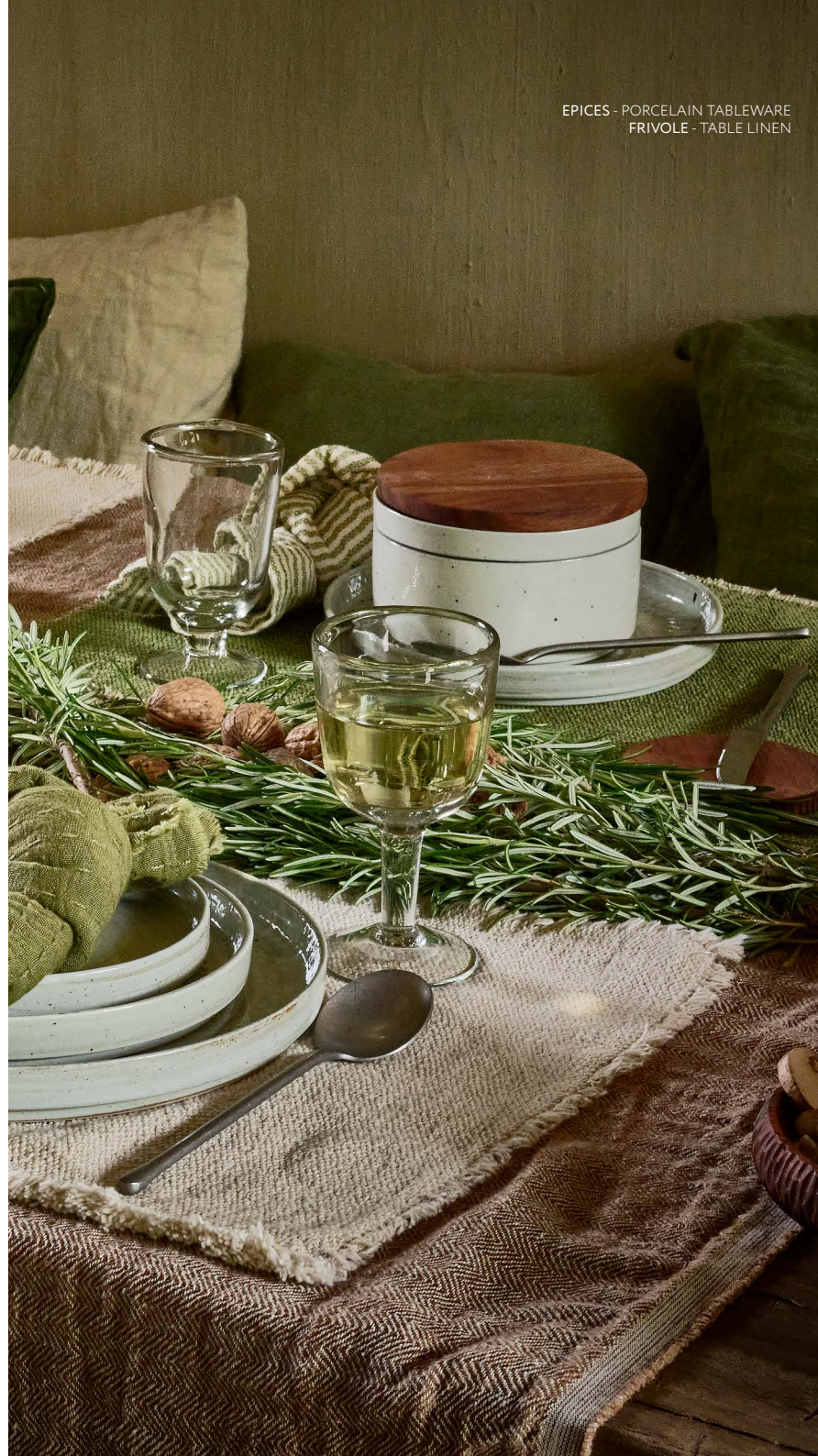
EPICES - PORCELAIN TABLEWARE FRIVOLE - TABLE LINEN