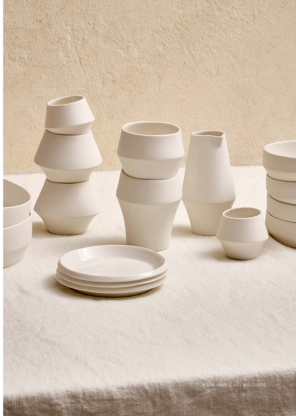
KOJIN - PORCELAIN TABLEWARE