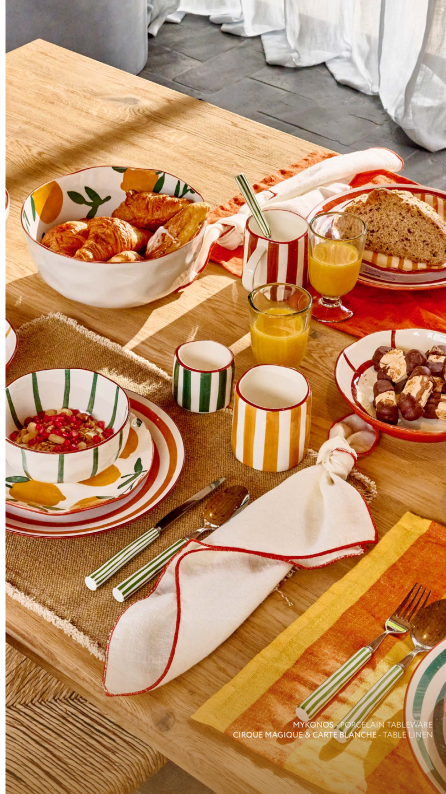
MYKONOS - PORCELAIN TABLEWARE CIRQUE MAGIQUE & CARTE BLANCHE - TABLE LINEN