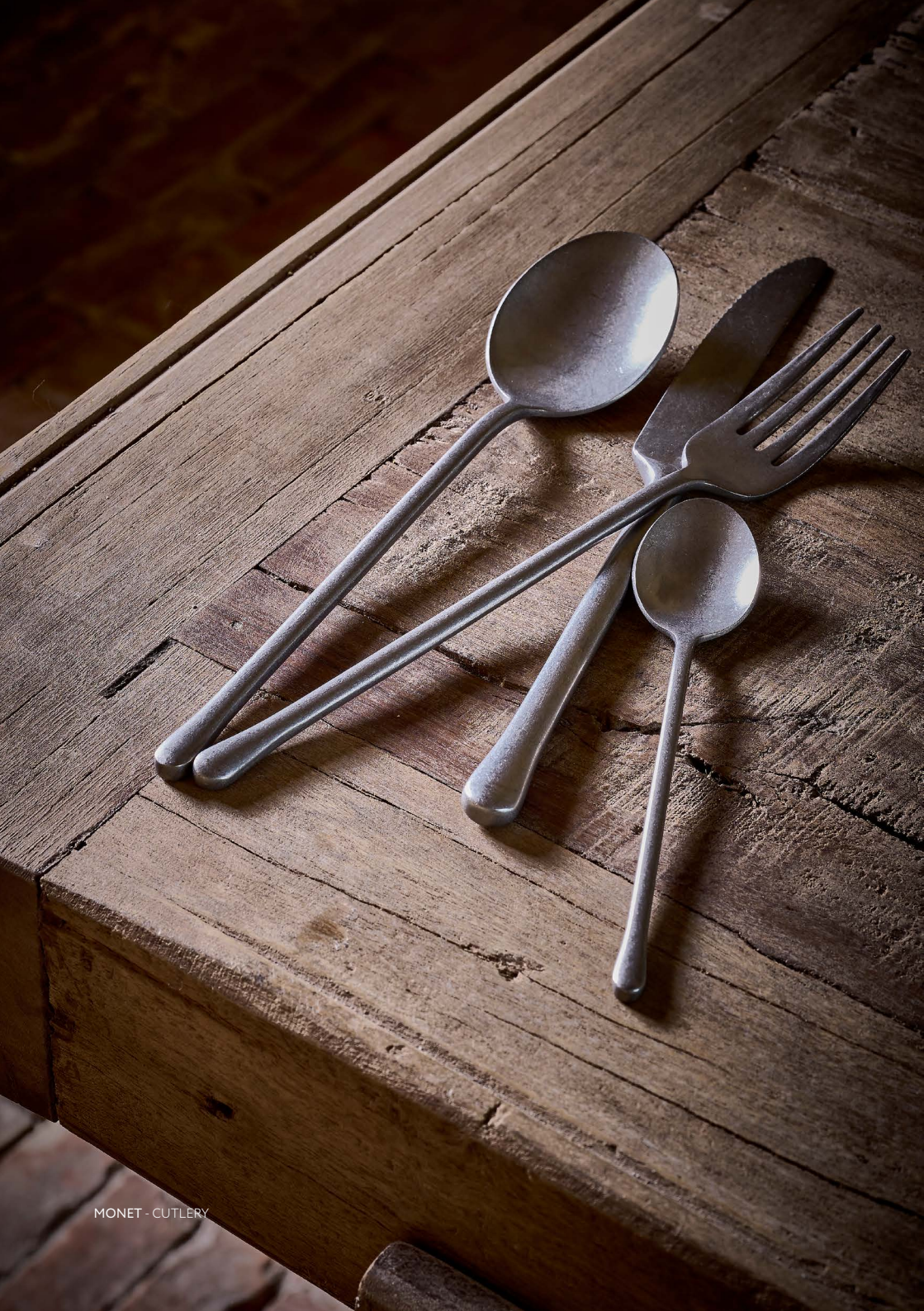
MONET - CUTLERY