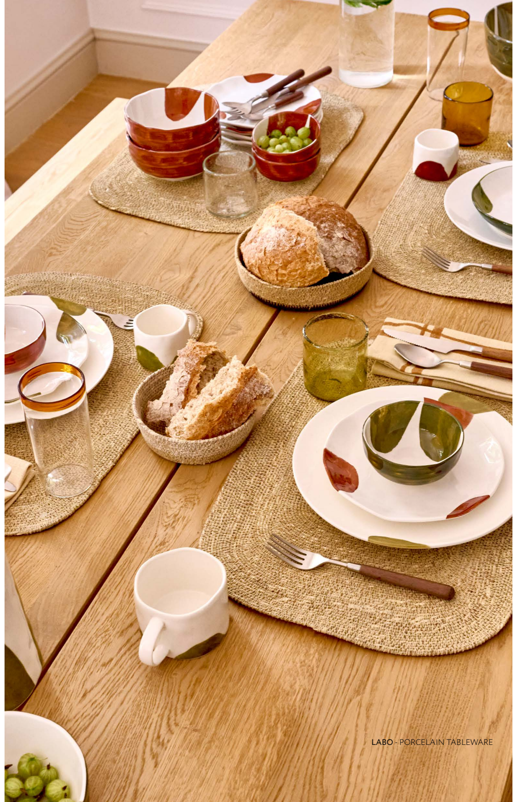
LABO - PORCELAIN TABLEWARE