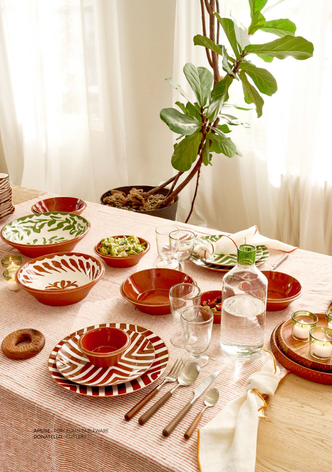
AMUSE - PORCELAIN TABLEWARE DONATELLO - CUTLERY